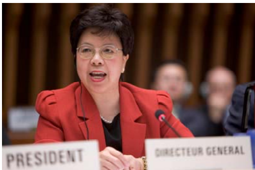
Dr Margaret Chan, Director General of WHO

As tuberculosis is one of the official IPSF public health campaigns, we were particularly interested to learn of the progress made so far towards achieving the UN Millennium Declaration of halting and reversing TB incidence by 2015. The WHO Executive Board urges all member states to develop and implement long-term plans for TB prevention and control in line with the Global Plan to Stop TB 2006-2015. During the week, IPSF was able to meet a representative from the Stop TB Partnership and discuss how IPSF members can help further implement the Global Plan to Stop TB. Look out for further information on how you can make contribution to World TB Day on 24th March, in the next special edition of the IPSF Newsletter.